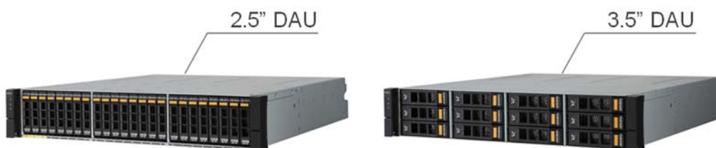
Figure 1-1: M110/M310 DAU 2.5" and 3.5" form factor

The M110/M310 Disk Array Unit (DAU) is a disk storage device that can contain both storage controllers and disk/solid-state drives in its 2U chassis. The M110/M310 DAU supports both 2.5" and 3.5" form factor. The 2.5" DAU accommodates up to 24 2.5" drives and 3.5" DAU accommodates up to 12 3.5" drives. By adding Disk Enclosures (DE), the M110 system can support maximum 120 drives for both 2.5" and 3.5" form factor, while the M310 system can support maximum 240 drives for 3.5" form factor and 480 drives for 2.5" form factor. The M110/M310 DAU requires at least three 2.5"/3.5" drives to be operational. Please refer to Step 3 for more information about the DE and drives.