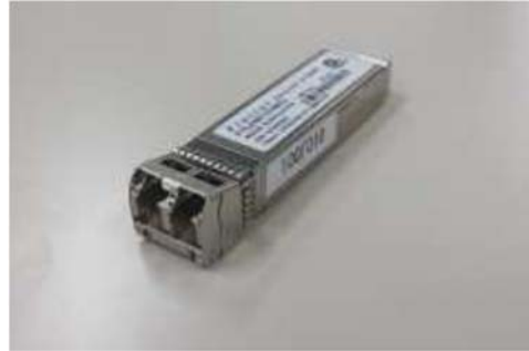
Figure 3: Small Form Factor Pluggable (SFP)

The M110 DAU is equipped with 8GB cache memory on each controller canister (total 16GB cache memory for dual controller configuration) as standard, so there is no need to order any cache memory. The M310 is not equipped with any cache memory as standard so cache memory must be ordered. The M310 supports two cache memory capacities, 12GB on each controller (total 24GB) or 24GB on each controller (total 48GB). The M310F is equipped with 24GB cache memory on each controller canister (total 48GB), so there is no need to order any cache memory.