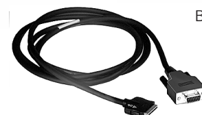
PC Connect Cable

NEC is a registered trademark used under license by NEC Computers Inc. MobilePro is a trademark used under license by NEC Computers Inc. Microsoft Windows CE and the Windows CE logo are either registered trademarks or trademarks of Microsoft Corporation in the United States and/or other countries. All other trademarks and registered trademarks are the property of their respective owners. ©2000 NEC Computers Inc. Printed in Japan. Information in this publication is subject to change without notice.